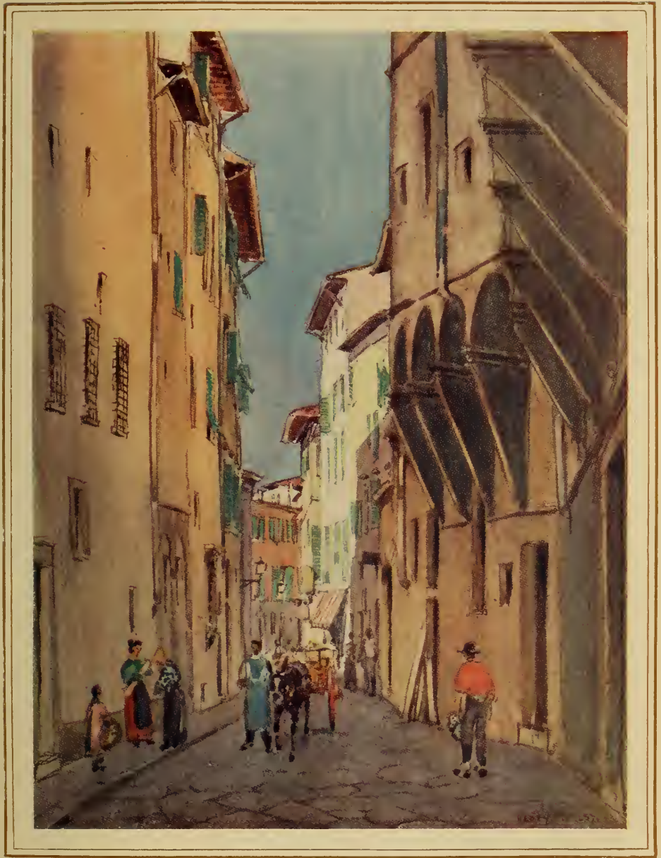
THE VIA DE' VAGELLAI FROM THE PIAZZA S. JACOPO TRAFOSI